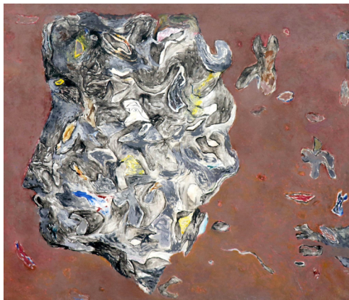
The Unexplored Tendencies Oil & Acrylic on Canvas 48" x 54" | 2000

( https://artdaily.cc/news/91984/Artist-Nasan-Tur-creates-a-live-printmaking-studio-at-Blain-Southern-Berlin )